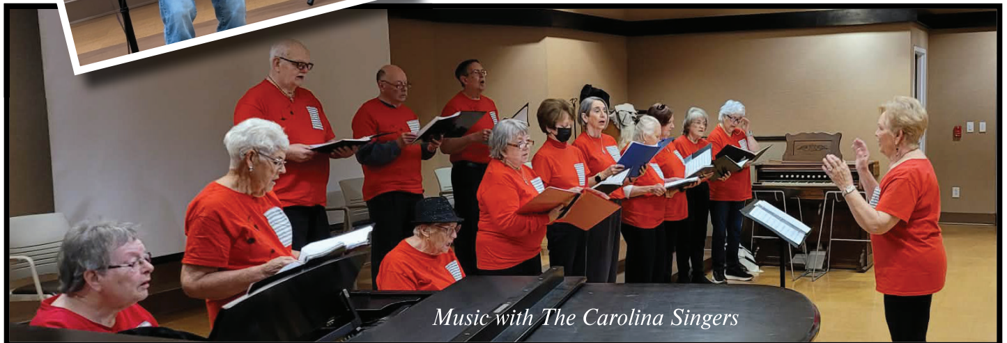
Music with The Carolina Singers