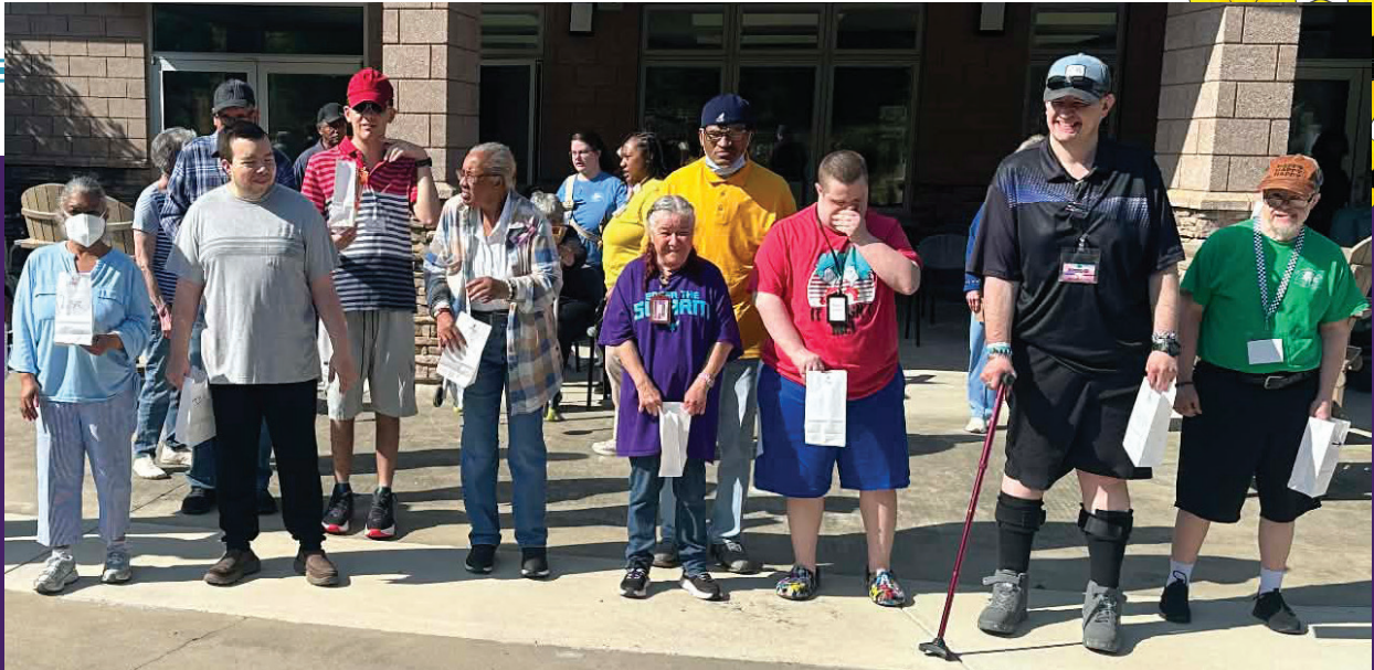
Participants get ready for the 2026 LEC Easter Egg Hunt!

It is NOT a nursing home, which takes the person out of the home and community. It is NOT in-home care, which leaves the person isolated.