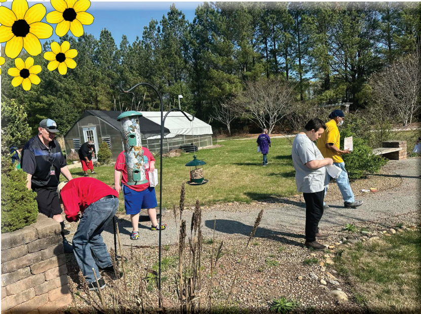
Participants race to find the most eggs.