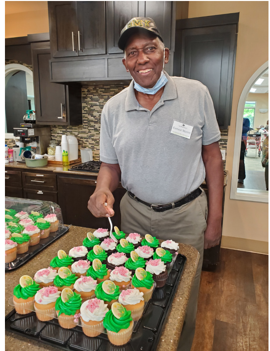
Veteran Earnest celebrates his 77th birthday.

Extension Club Of Cleveland Co.- Birthday Party Treats