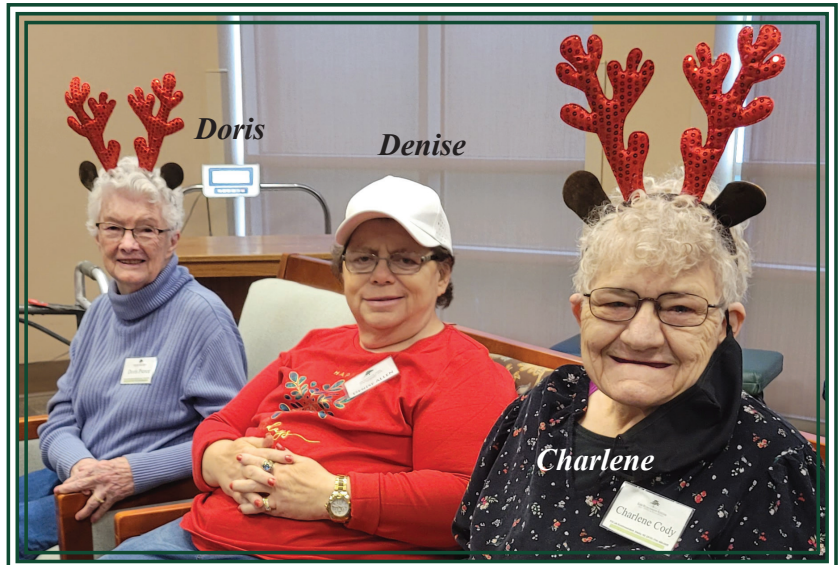
The "Christmas Countdown" theme days were a big hit! Above, the ladies show off their antlers for " Dress Like a Reindeer" day.