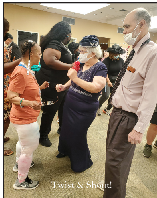
Twist & Shout!