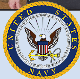
Navy Veteran Horace