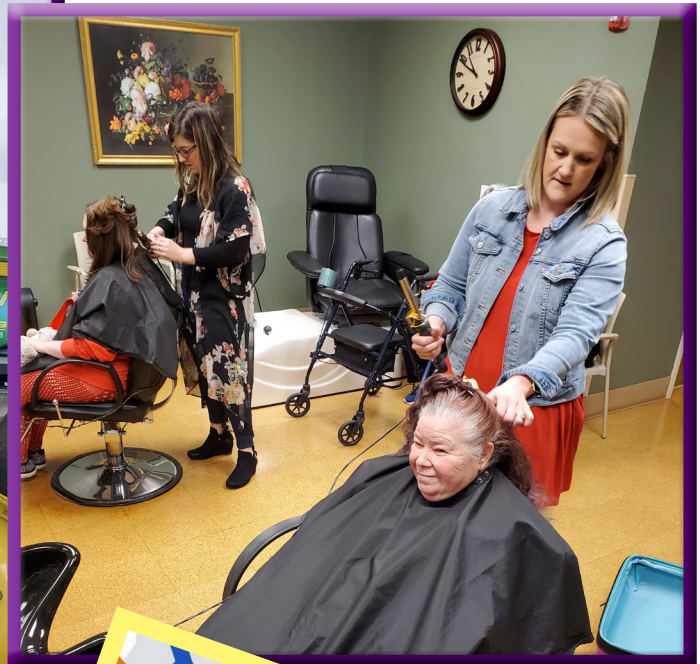
The ladies of LEC enjoy makeovers with a visit from Vibe Hair Lounge.