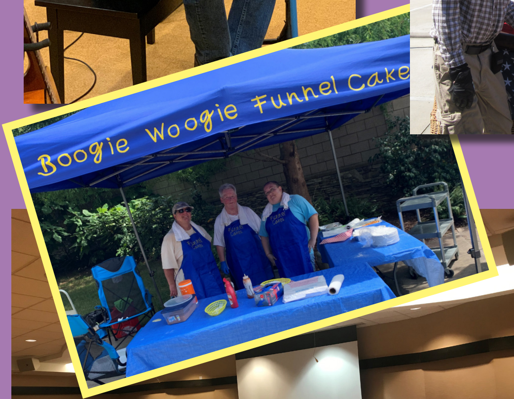
Participants enjoyed delicious funnel cakes made by Boogie Woogie Funnel Cakes.