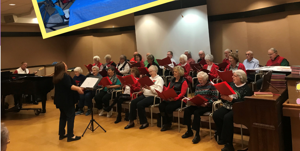
The Foothills Choir shares their favorite selections with LEC participants.